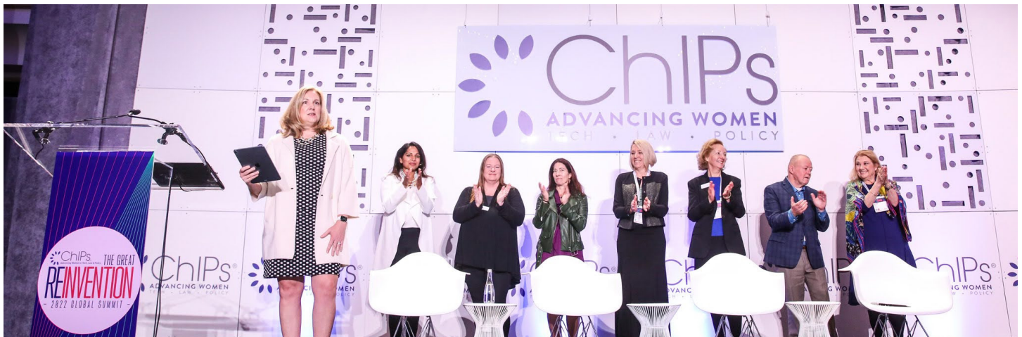
ChIPs team members take a bow at ChIPs Global Summit in San Francisco.