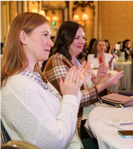
More than 170 rising stars attended ChIPs NextGen 2022 during ChIPs Week in San Francisco.