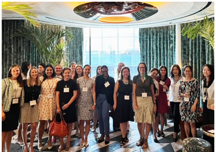
ChIPs New York held several notable events, including a panel at U.S. District Court in New York.

Fifty-two percent of attendees at last year's ChIPs Global Summit were employed in-house, 42% worked for law firms and the rest worked for government, service providers and academia/nonprofit. Fifty-one percent responding identified as white, 22% identified as Asian/Pacific Islander, 4% identified as Hispanic or Latino, and 3% identified as Black or African American. ■