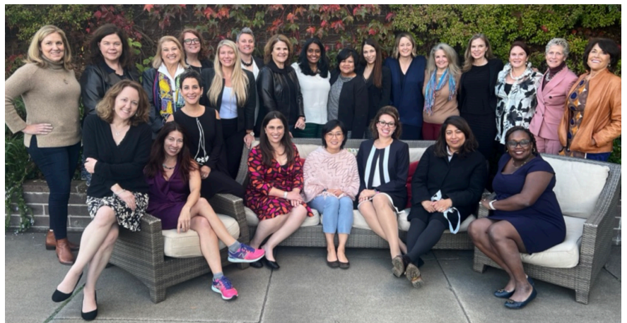
Class of 2023: ChIPs yearlong General Counsel Boot Camp launched October 28.

ChIPs chapter events around the world add to our industry's education — and our members' individual and collective power. Many ChIPs education programs qualify for continuing legal education (CLE) credits. ■